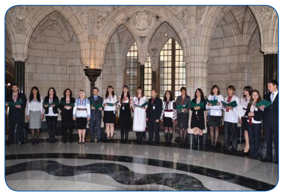
On October 24, 2011, the first Ukrainian Day on the HILL took place in the House of Commons. Captioned are CUPP 2011 Interns who performed a concert in the Rotunda of Centre Block for MPs, staff and visitors.

Contact Us Chair of Ukrainian Studies Foundation 620 Spadina Avenue Toronto, Ontario, Canada M5S 2H4 Tel.: (416) 234-9111 Fax: (416) 234-9114 www.KATEDRA.org